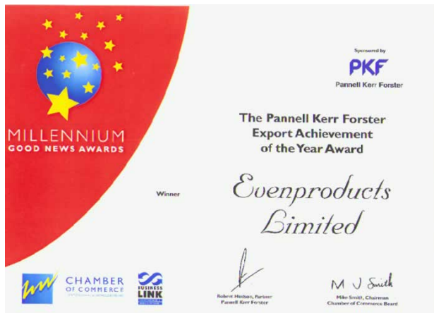
Export Achievement of the Year Award - Hereford & Worcester Chamber of Commerce and Industry