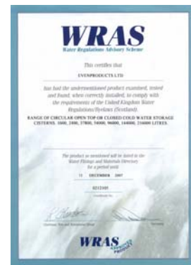
WRAS Approved Product Certificate No. 0212105