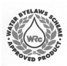
WRC Approval Number: 9705017 Water Storage Tanks